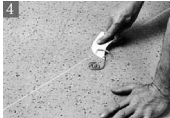
4. Trim the joint with a smooth sharp spatula.