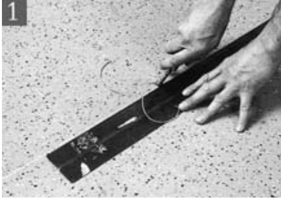
1. Cut in joints and allow adhesive to set, then groove the joints to an even, consistent depth. The standard of grooving will affect the strength and appearance of the joints.

range of colours to complement the floor colours. Hot welding using appropriate equipment is more difficult and slower than with sheet vinyl flooring and is not recommended with profiled flooring or tiles.